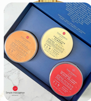
BAKER'S BREW "Petite Gift Box" $128