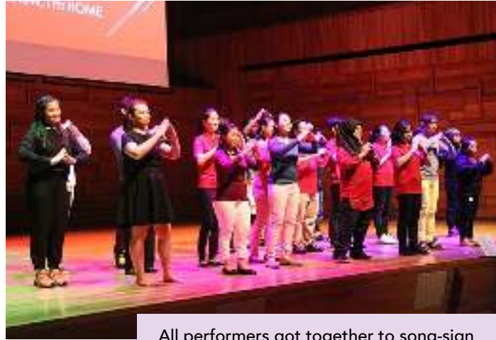
All performers got together to song-sign "Home" with the audiences

The objective of the concert was to raise deaf awareness through drama and dance and to advocate for information accessibility for the Deaf and Hard-of-Hearing by emphasizing the importance of visual cues and sign language for this community.