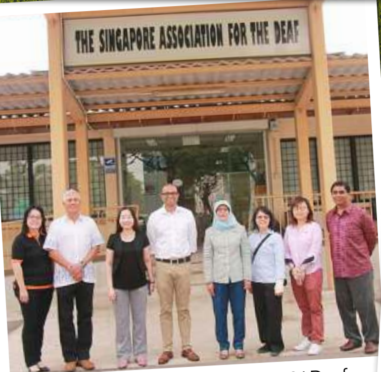
President Halimah Yacob's Visit to SADeaf on 16 Sep 2017