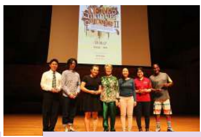
Token of appreciation to all performers for their support and contribution towards the concert.