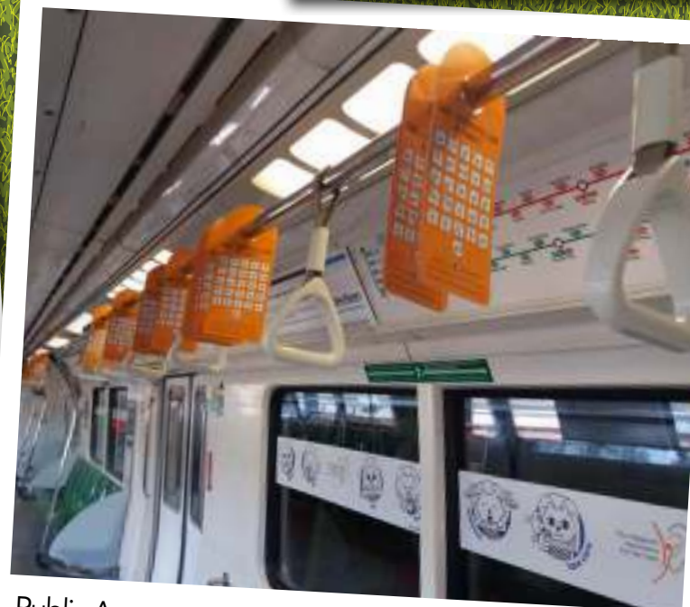
Public Awareness Campaign on SMRT Train during IWD