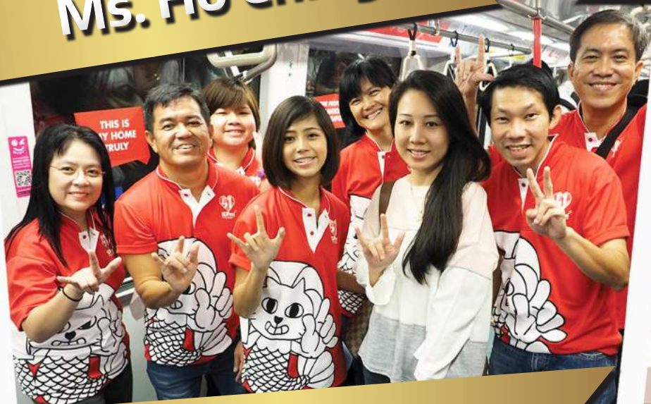
Merdeaf Go Flashmob in NDP2016 themed SMRT train