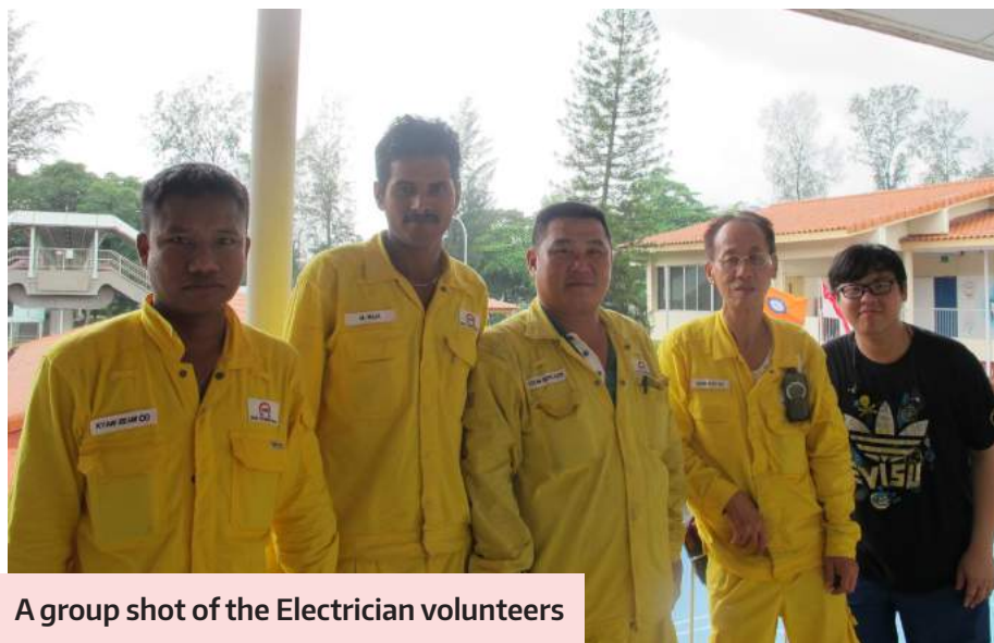
A group shot of the Electrician volunteers

When SADeaf premises needed some electrical repair works to be done, we turned to our long-time supporter and corporate ambassador Mun Siong Engineering Limited, for help! Without hesitation, a team from the company turned up to fix much needed maintenance