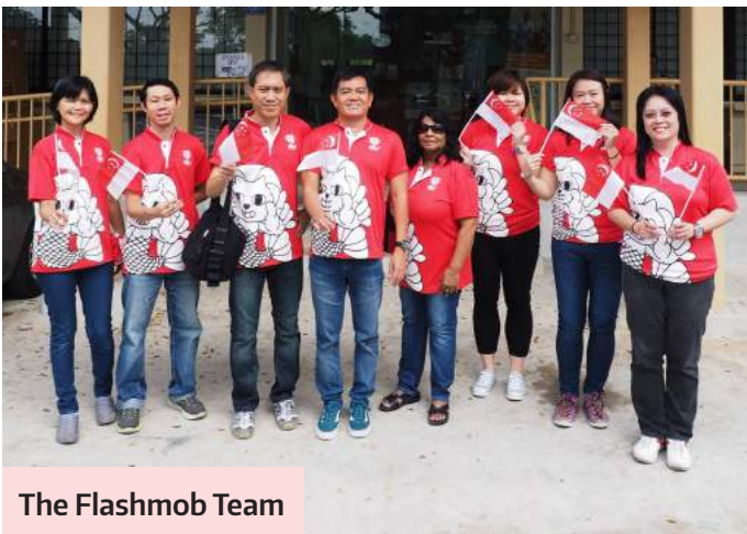
The Flashmob Team