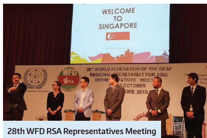
28th WFD RSA Representatives Meeting