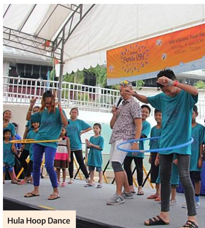
Hula Hoop Dance