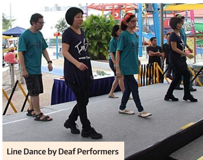
Line Dance by Deaf Performers