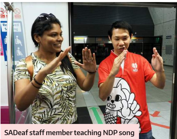
SADeaf staff member teaching NDP song

To start off the NDP celebrations and create awareness for the Association, a flashmob team from SADeaf hopped on an NDP themed SMRT train from Paya Lebar to HarbourFront to encourage commuters to song-sign the popular NDP songs. Thank you LTA and SMRT for your support!