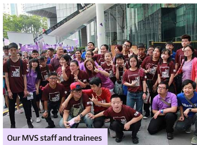
Our MVS staff and trainees

A strong contingent of over 60 persons from SADeaf, made up of our clients, members, volunteers, supporters and staff, joined thousands at the 4th Purple Parade event held at Suntec City on 5 November to celebrate the inclusion and abilities of people with special needs.