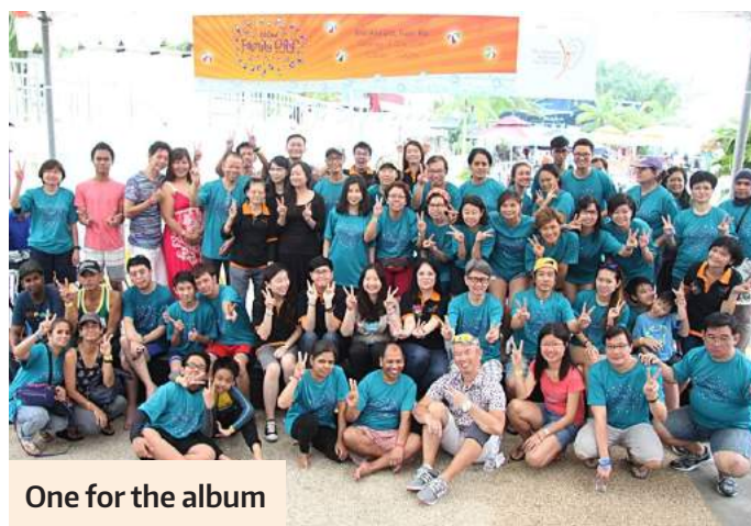
One for the album