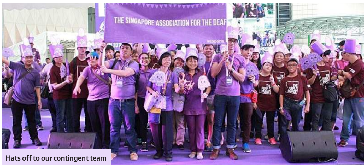
Hats off to our contingent team