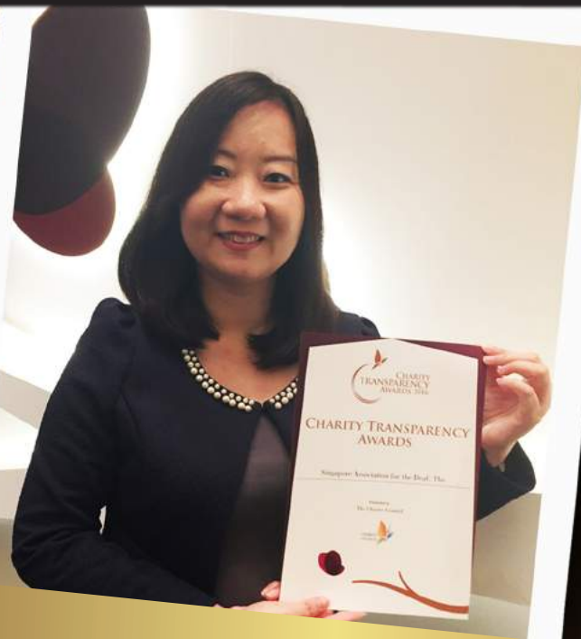
SDeaf a proud recipient of the Charity Transparency Award