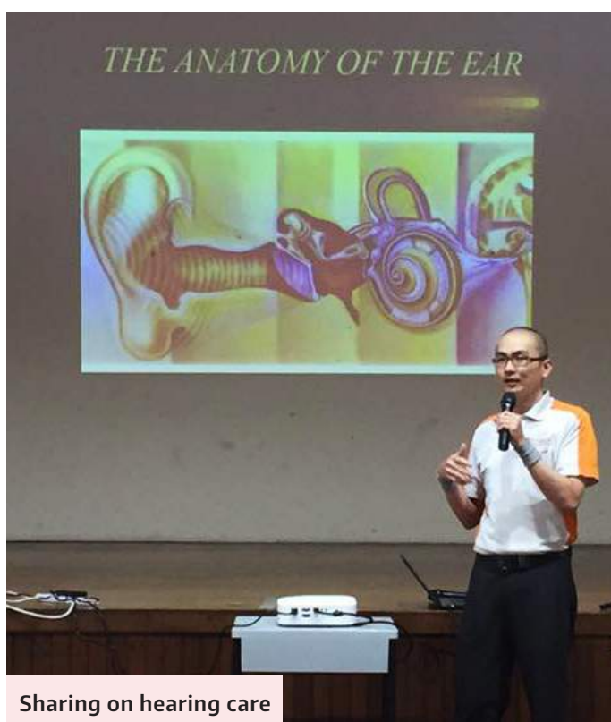
Sharing on hearing care

SADeaf is proud to be the Eurasian Association's first off-site community partner when it played host to over 60 guests (including guests from the South West Community Development Council) during its "Tea with Neighbours", held at SADeaf hall on 13 November 2016.