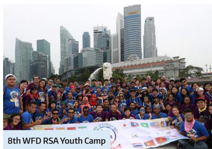
8th WFD RSA Youth Camp