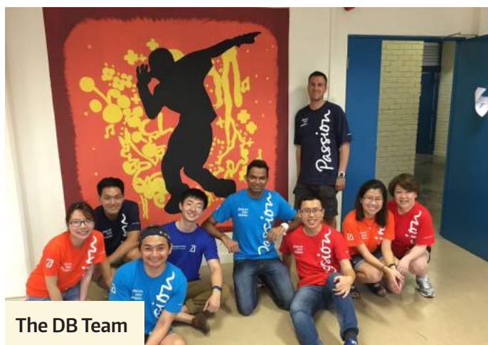
The DB Team

A visit to the Mountbatten Vocational School (MVS) by some volunteers from Deutsche Bank (DB) ended with the bright idea of adding “fun and colour to the dull looking” MVS Recreation Room.