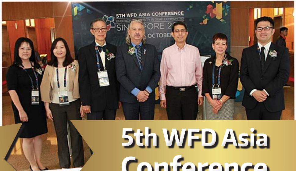
5th WFD Asia Conference